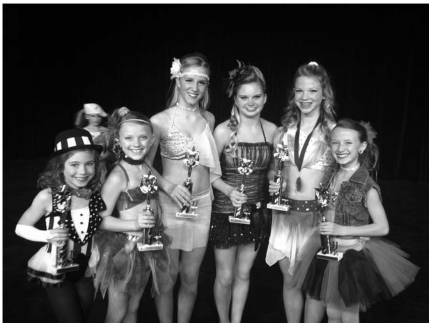
Several Award-Winning Soloists from Nov. 20th Competition

Come out and supporter the dancers at Centerville H.S. Saturday Dec. 3 rd or at Northridge H.S. for the Vantasia solo contest on Saturday, Dec. 10 th